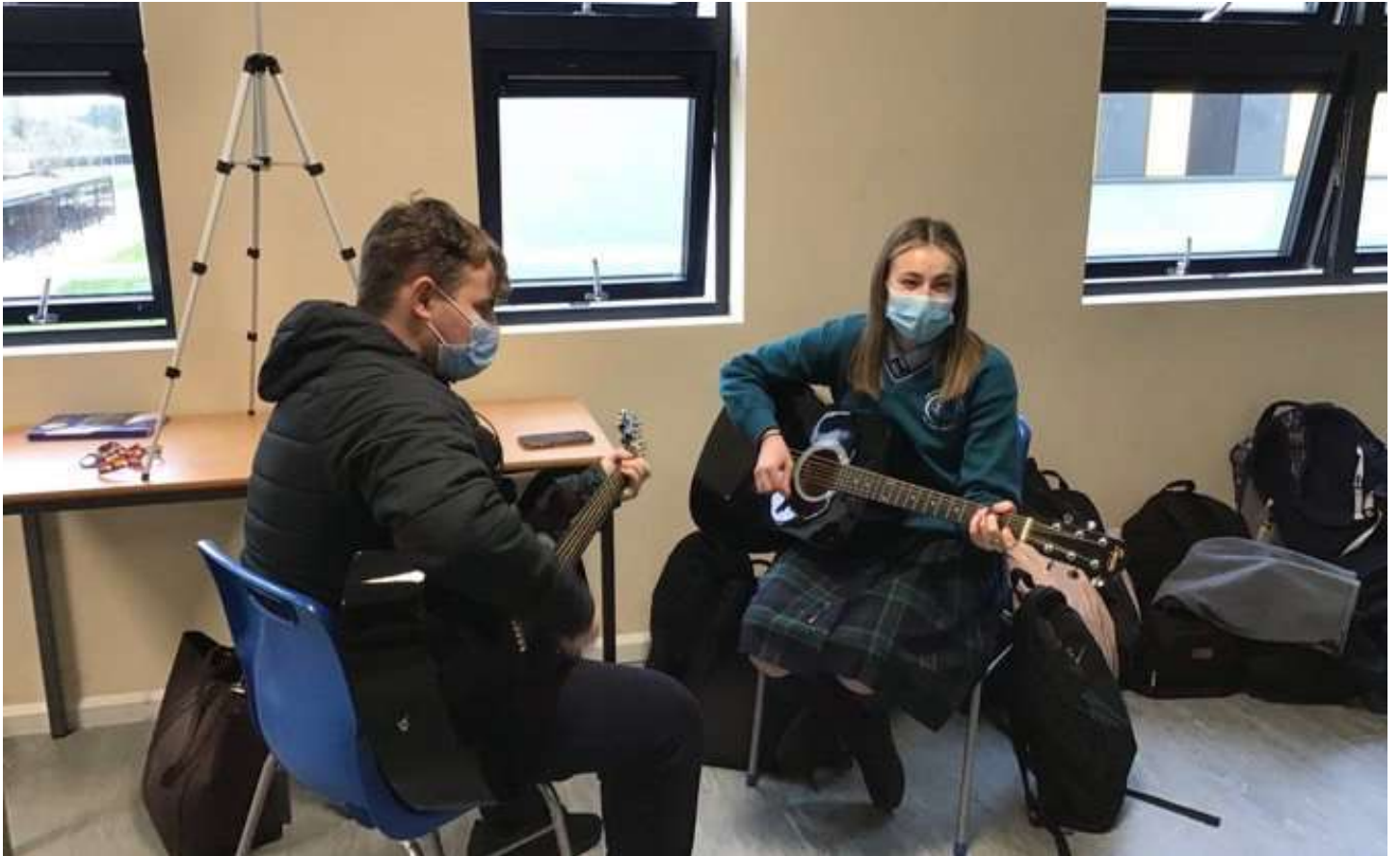
Music to our ears

Throughout the year students from all years have enjoyed coming together, during lunch times to sing their hearts out and practice their instruments, such as guitar. These students have practiced extremely hard all throughout the year preforming for school events.