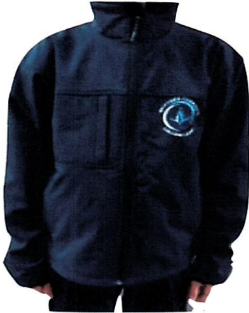
GCC School Navy, Crested, Soft Shell Jacket.